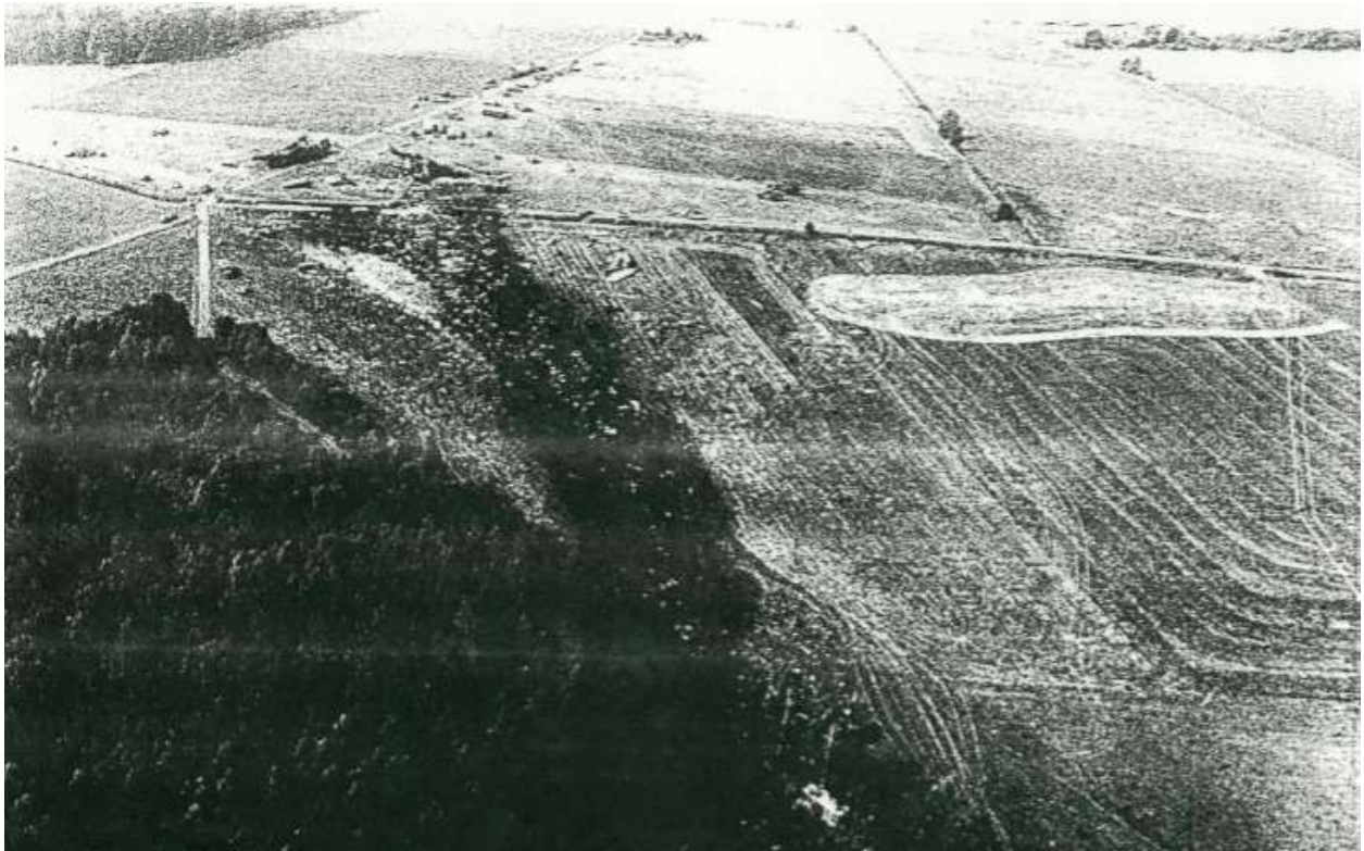
Aerial photo of the crash site from the official accident report

destroyed by fire. The aft part of the troop compartment also separated from the aircraft. It rolled upside down, broke apart, and came to rest away from the fire.