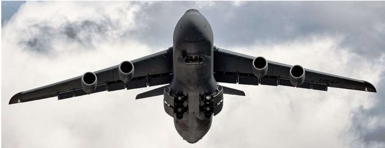
C-5M Super Galaxy from the 60th Airlift Wing Travis AFB, photo taken from the fence at Ramstein Air Base, Germany.

Story by Dave Trojan, Aviation Historian/Archaeologist