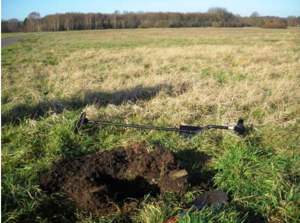
Digging in the field where the first artifact was discovered

placed my metal detector down on the ground, when suddenly I got an immediate “hit”. I recalibrated the detector and tried again and got another “hit” in the same spot. I started digging and within a few minutes, I had dug up a piece of the C-5 Galaxy aircraft.