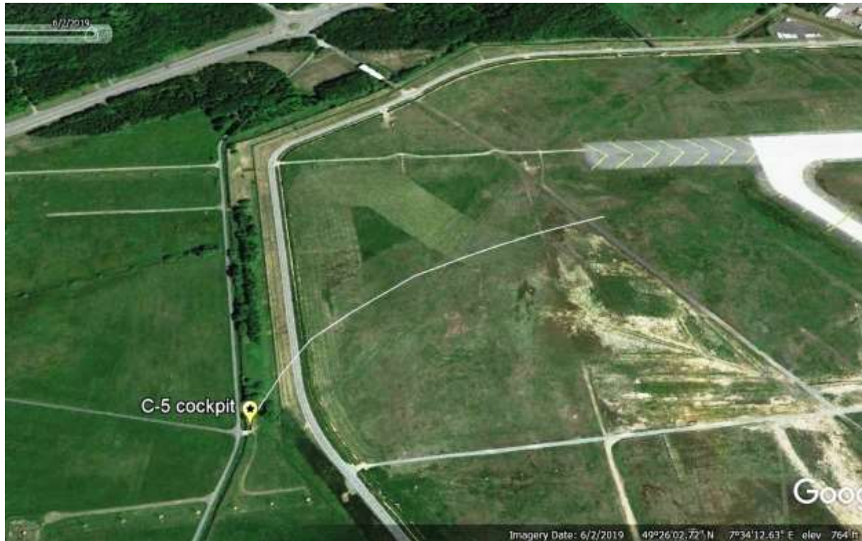
Google Earth derived flight path and crash location

My investigation of this accident began in December 2019. I was newly arrived at Ramstein AB and I had a partial copy of the official accident report along with about a hundred other accident reports that needed to be investigated in Europe. I decided to investigate the C-5 accident because the site was easily accessible. The C-5 official accident report contained a map and other vital information which I compared to Google Earth to determine the precise crash location. The terrain has changed considerably since the accident and all the trees have been cut down and the runway has been lengthened since the 1990s. Photos of the crash site, then & now compared below.