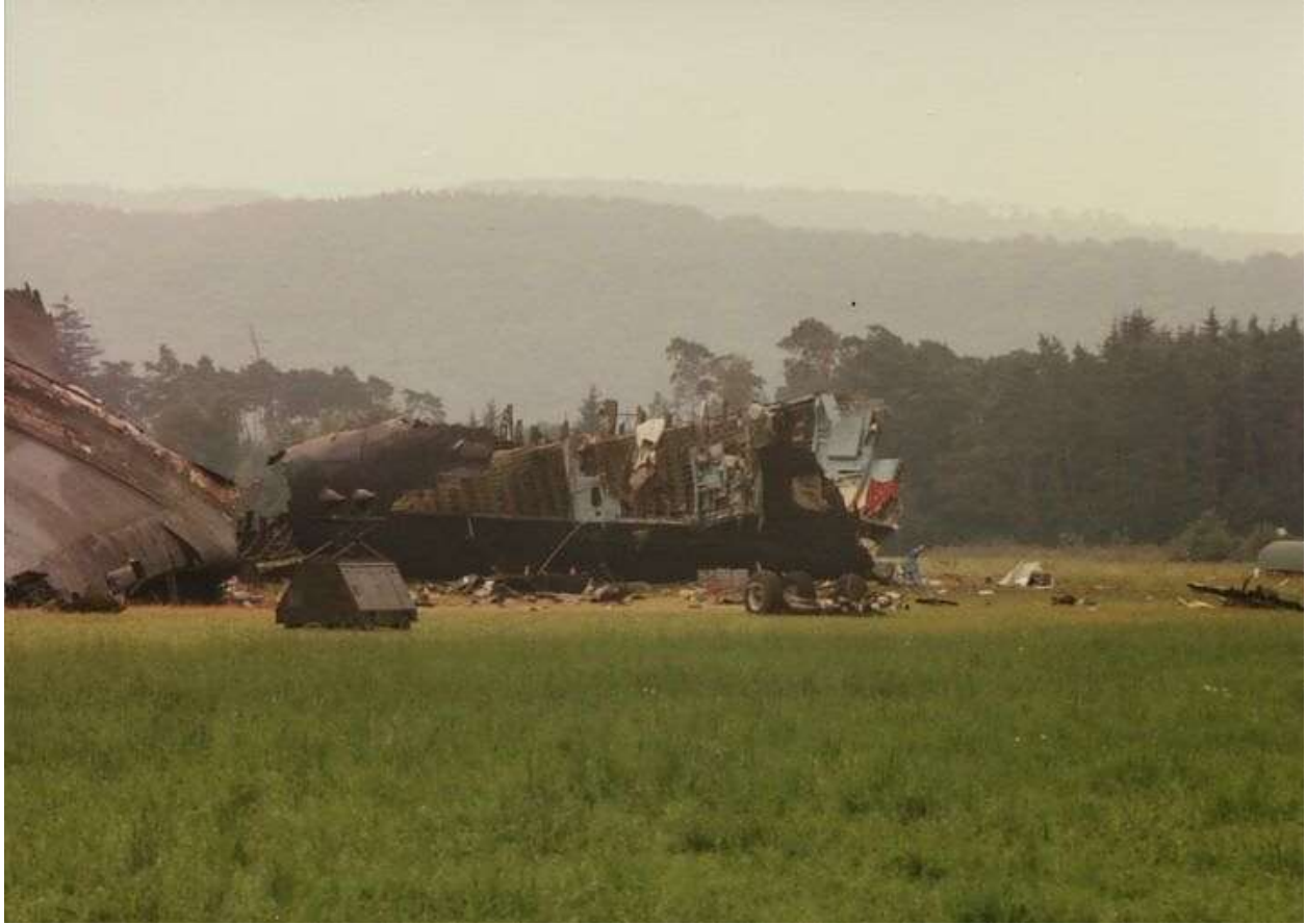
Another view of the troop compartment with part of a landing gear