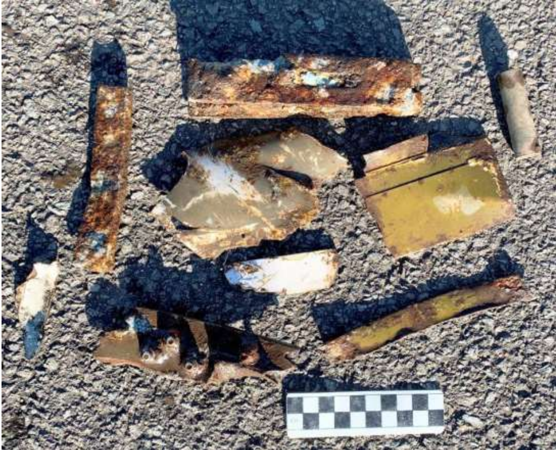
Artifacts discovered at the crash site