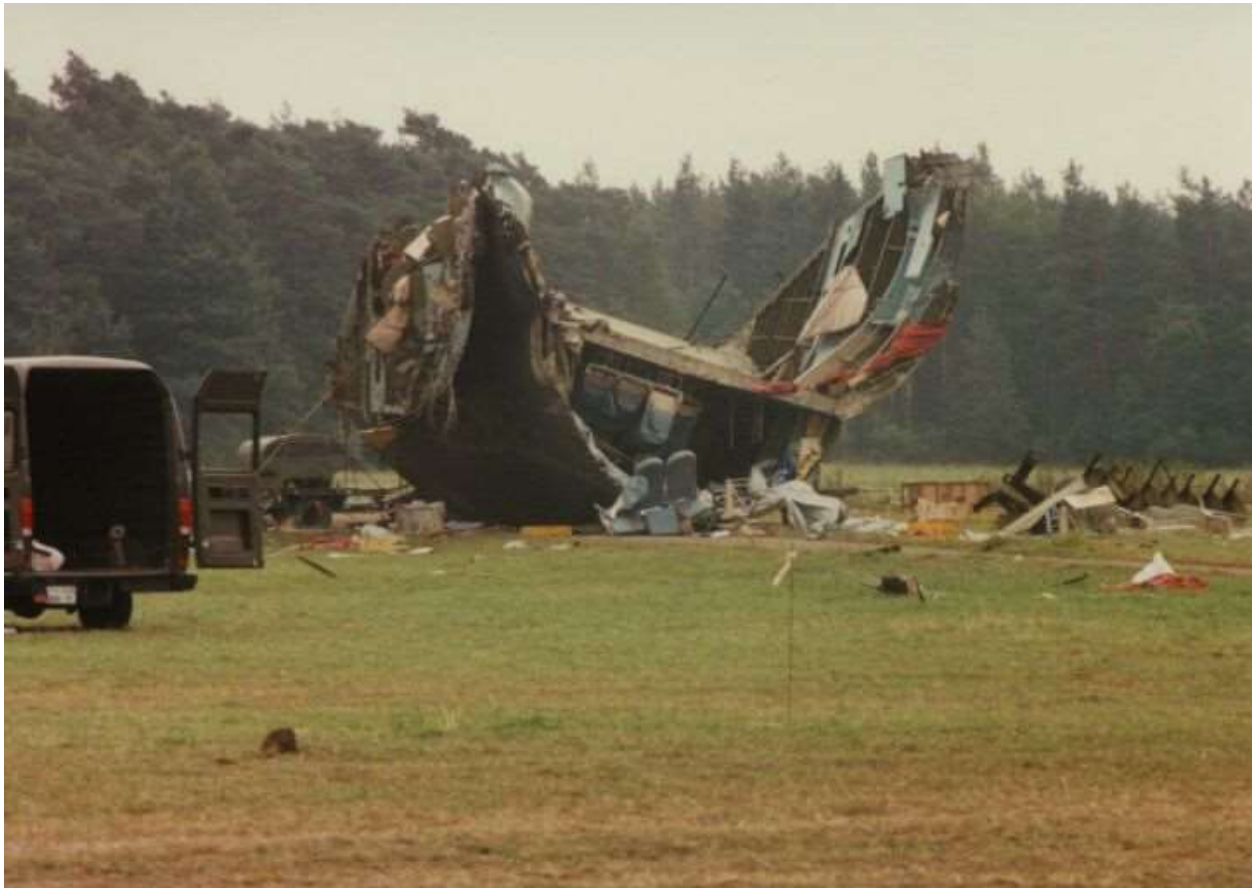
Back/top of the troop compartment where the survivors were sitting