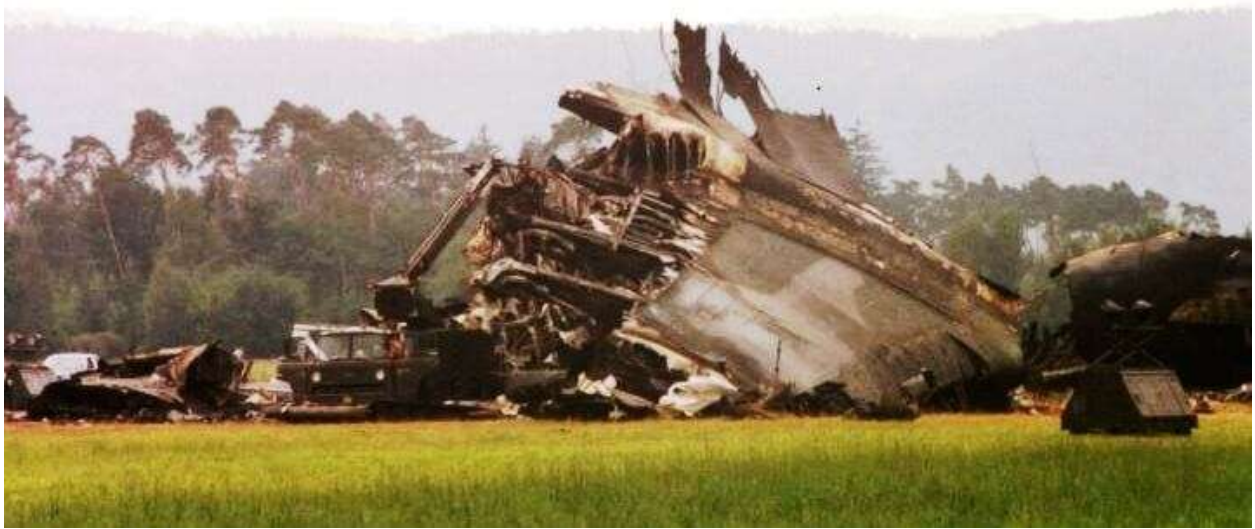
The largest piece of wreckage was the wing root