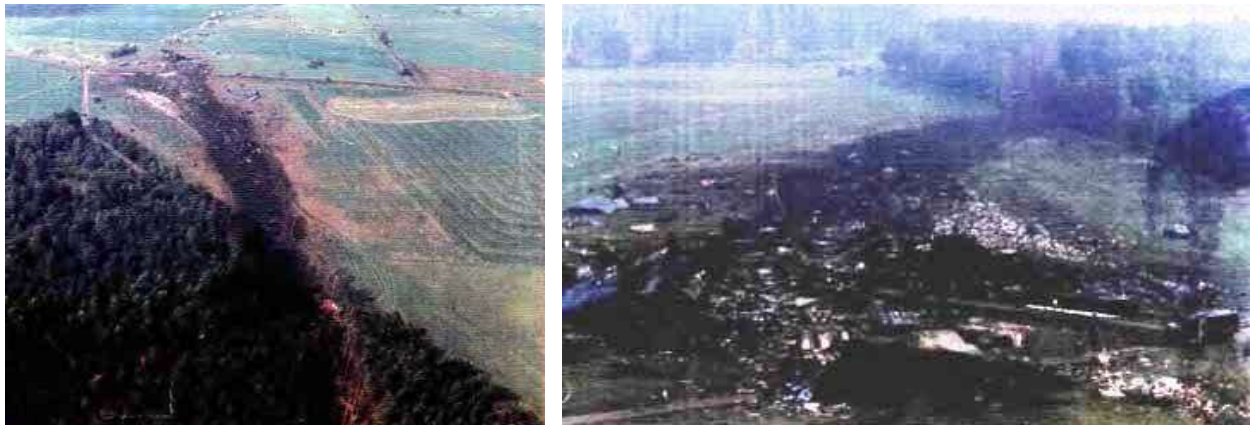
Aerial photos of the crash site taken shortly after the crash

Fire and crash rescue equipment responded immediately and reported that the major fire was under control at 0104 CEDT, however spot fires continued to flare up for several hours. Rescuers said darkness and dense fog hampered efforts to find victims and it took almost 12 hours to find the body of the 13th victim in the wreckage.